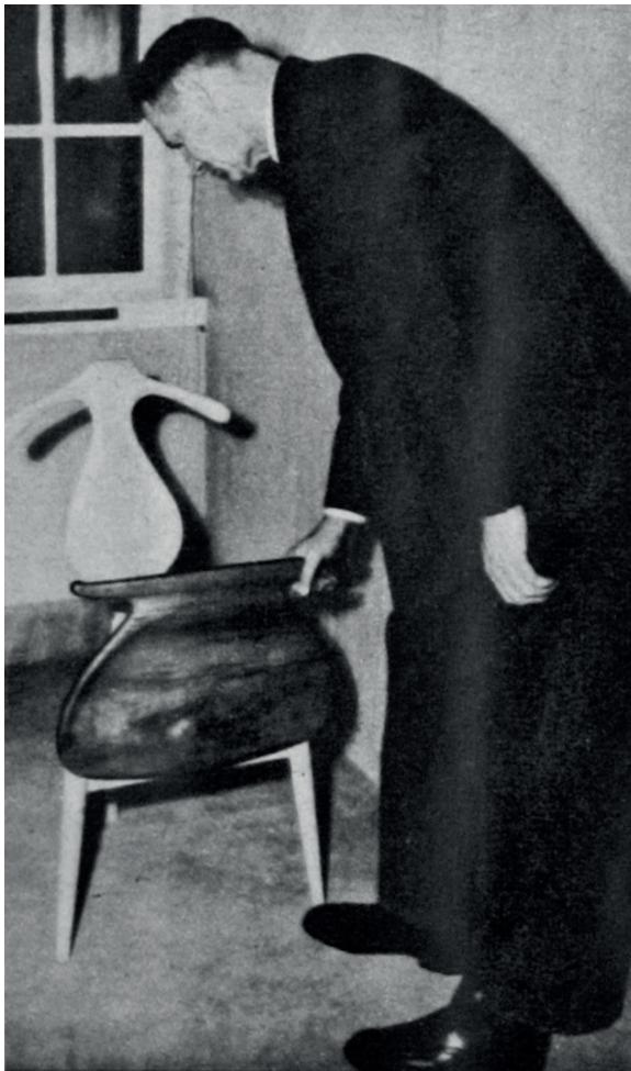
1953 King Frederik IX of Denmark is inspecting his new Valet Chair , the first one ever made. The chair is made of pine with a teak seat. The King immediately ordered another 9 Valet Chairs for the Royal Castles.