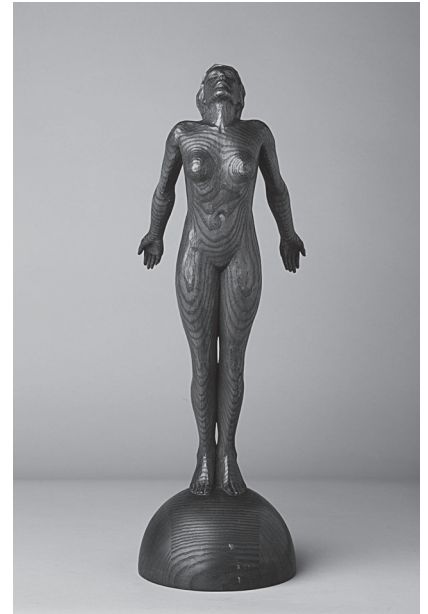
Examples of Wegner's early oak sculptures.

With hindsight, when studying these three dimensional sculptures they demonstrate the skills and understanding of proportion and space Wegner later employed in creating the Valet Chair and other masterpieces like The Round Chair , Swivel Chair and Cow Horn Chair .