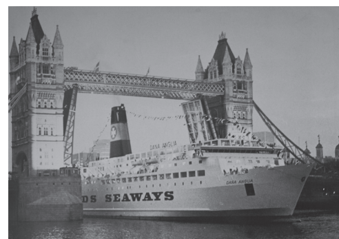
Dana Anglia - 1978

More than 30 years after the ferry's maiden voyage it has been renamed and upgraded several times and has sailed on a number of different routes between Denmark, the UK, France, the Netherlands, Poland, Norway and Sweden. Through all the years, the chairs have remained on board!